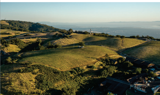
Top and Above: Santa Cruz Mountains vineyards Right: Santa Cruz Mountains AVA map

Site: Monte Bello Estate vineyard in the Santa Cruz Mountains. Cabernet sauvignon, merlot, petit verdot, and cabernet franc — oldest vines planted in 1949.