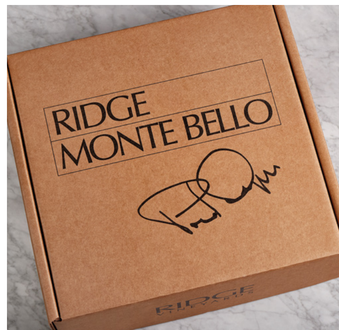
Left: The new Monte Bello box. Right: Fully compostable Green Cell foam protects the bottles inside.