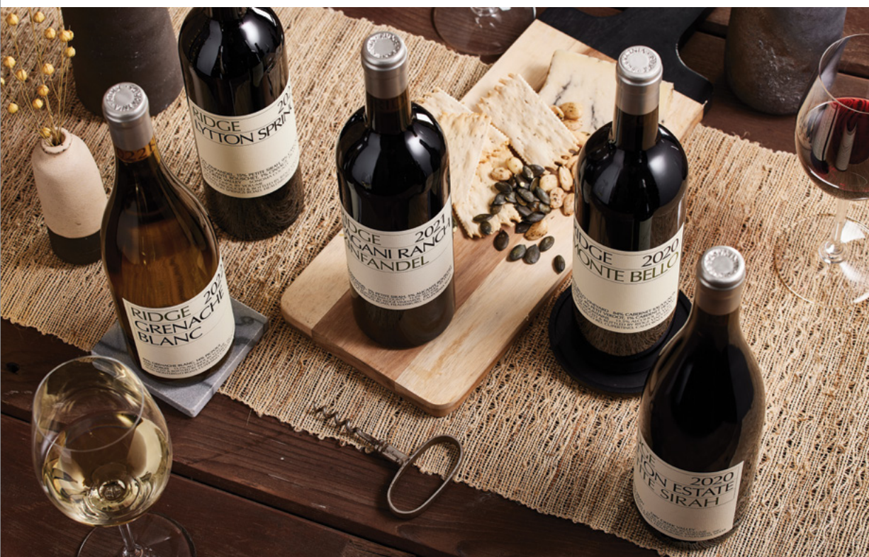
Below: The fall release wines: 2022 Grenache Blanc, 2021 Pagani Ranch Zinfandel, 2021 Lytton Springs, 2020 Lytton Estate Petite Sirah and 2020 Monte Bello.